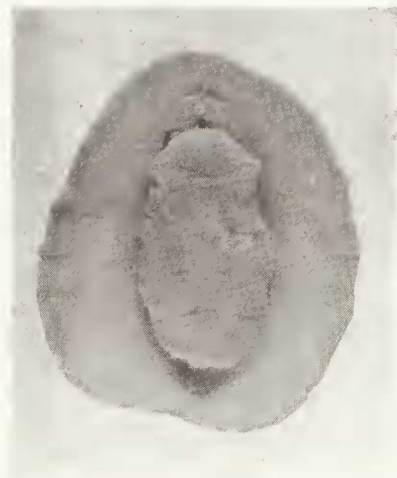
Onchidella patelloides (Q. and G.). San Remo, Westernport, Victoria. Dorsal view x 1\frac{1}{2} . (Left.) Ventral view x 1\frac{1}{2} . (Right.)